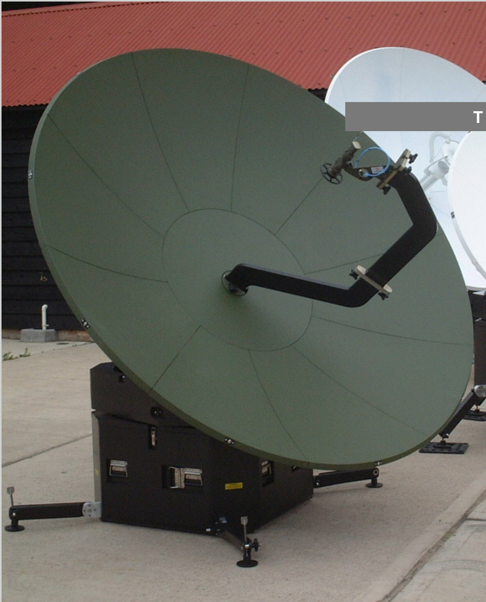
The FA-240 Antenna

A 2.4m flyaway antenna for multi band transmission